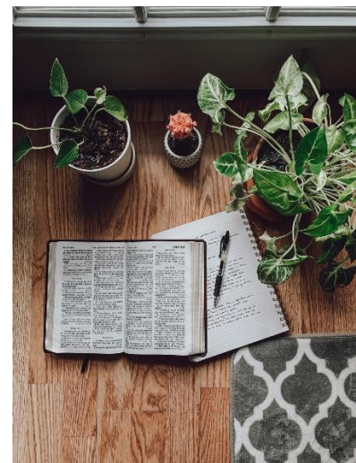
Bible Reading and Study

remain with God. Each of us – individuals and congregations – do this differently, whether through action, prayer, telling the good news of Jesus, all of us as we seek to live Jesus shaped lives.